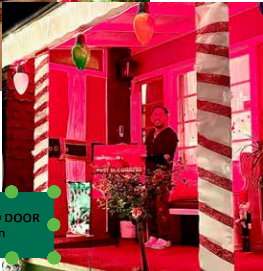
BEST DECORATED DOOR 919 Freeman