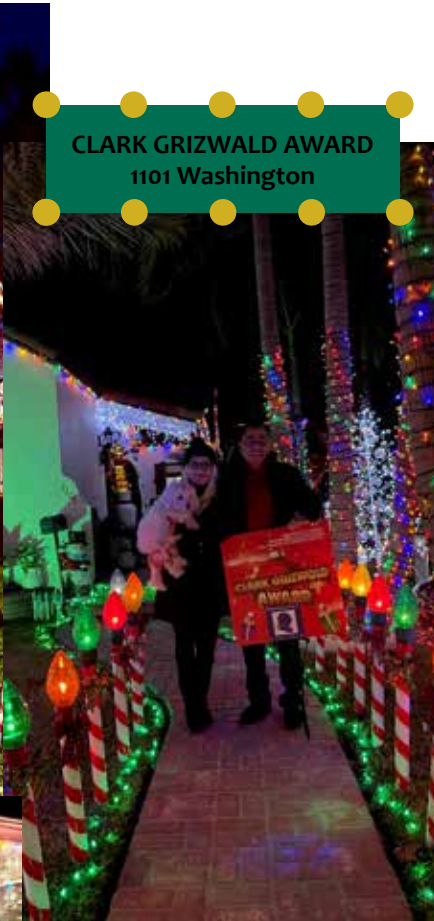
CLARK GRIZWALD AWARD 1101 Washington

WSNA's 2 nd Annual Holiday Decorating Contest WINNERS!!!