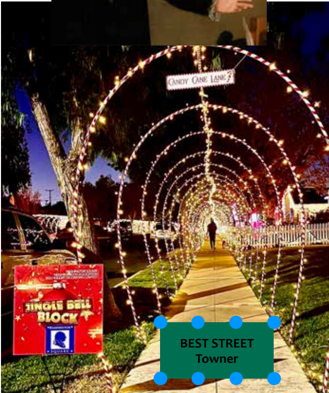
BEST STREET Towner