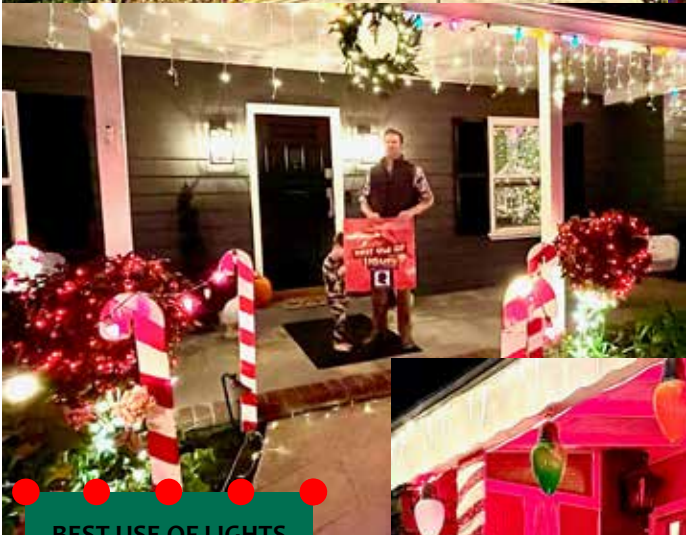
BEST USE OF LIGHTS 1015 Towner

WSNA's 2 nd Annual Holiday Decorating Contest WINNERS!!!