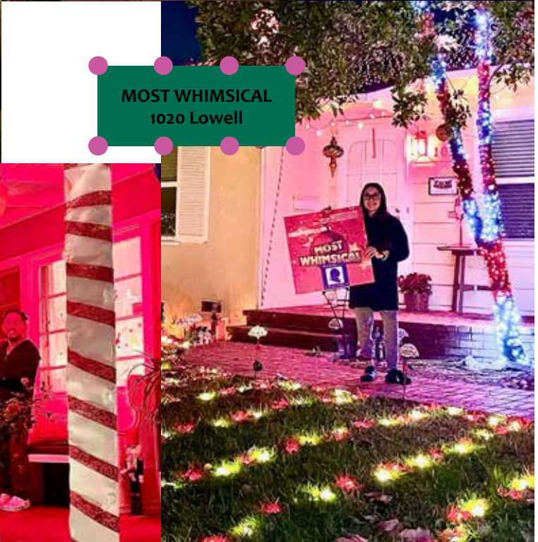
MOST WHIMSICAL 1020 Lowell