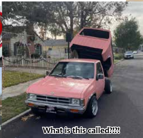
What is this called???